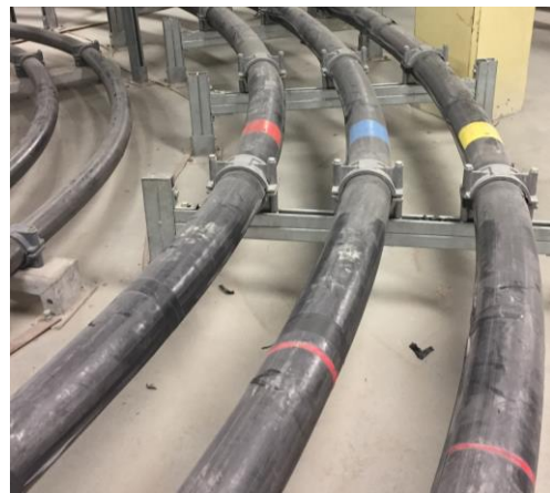
Underground Cable Termination

One major project requirement was full integration with the substation automation system (SAS) via the IEC 61850 communication protocol and PRP for redundancy. A special systems interoperability test was conducted at the SAS vendor’s facility and commissioned to ensure the DTS and substation automation systems are compatible with each other. AP Sensing’s SmartVision software was able to receive current load data and transmit alarms and values to SAS platforms via the IEC 61850 over dual fiber optic