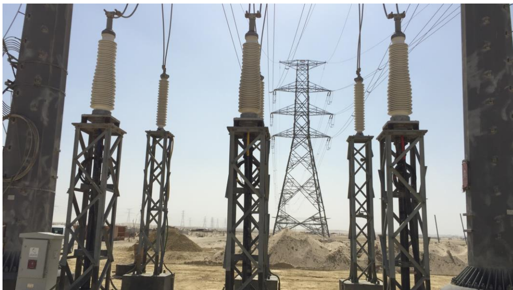
Overhead Line Termination

Our technology not only provides the thermal profile of the power cables, but also greater insights to the actual conductor temperature and transient statuses with our Real Time Thermal Rating (RTTR) engine. AP Sensing is one of SEC's approved vendors and provider of DTS technology for many of its projects.