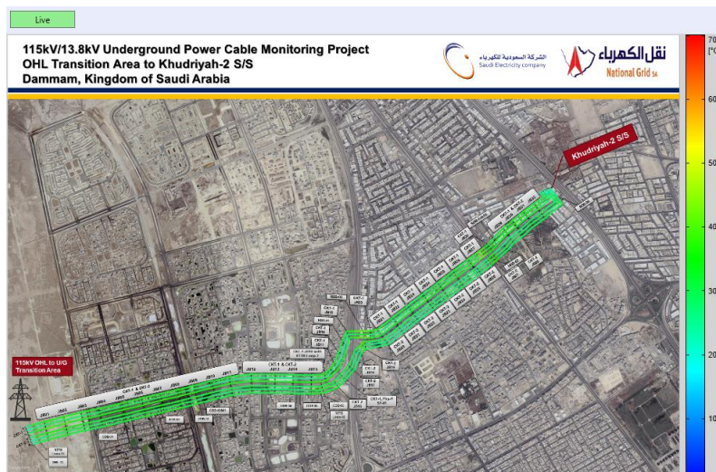
Live view of underground cable temperature

The system rack was equipped with an industrial PC and SmartVision. SmartVision is a centralized software responsible for data collection, storage, processing and visualization. It effectively collects DTS data and further maps it to power cable lengths, so the operator can visualize the data.